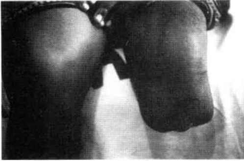
Fig. 2. A short below-knee stump. A through-knee amputation has been found necessary for successful limb fitting.

heal before referral, and which proved too short to be fitted (Fig. 2). If the below-knee stump is short, excision of the fibula is strongly advocated. The possibility of performing a through-knee amputation also has to be considered, instead of struggling with a short below-knee stump that is inadequate for the task. Too short a stump produces a short lever that is inadequate to control the prosthesis, requiring excessive energy and resulting in high local pressures. A below-knee stump which is too long is liable to fracture if the patient falls, and atrophy of the muscles results in an ill padded stump that causes fitting difficulties, and inadequate terminal cover (Fig. 3).