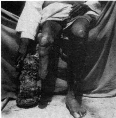
Fig. 3. An excessively long below-knee stump is going to become, in the long run, a frustum of cone unfit for a prosthesis, due to severe atrophy of the muscles.

Nine stumps were revised because of persistent bone or soft tissue infection. Four