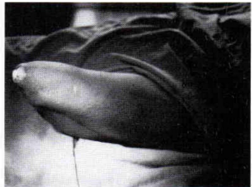
Fig. 1. An above-knee stump for which a procedure of revision has been necessary. The patient was amputated for a long standing leprotic ulcer of his foot. The possibility to perform a through-knee amputation has been overlooked.

Five below-knee stumps were revised because they were too long, and 2 too short for prosthetic fitting. This resulted from inadequate level selection. There was one below-knee 8 cm stump, which took a year to